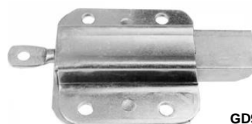
GD9-G22388 (‘nose-up’ bolt allows use on inward-opening doors)