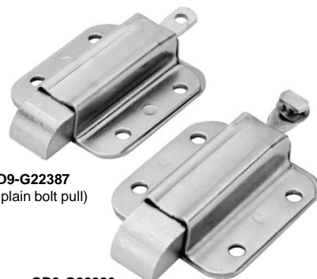
GD9-G22387 (with plain bolt pull)