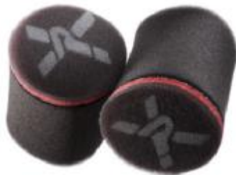
Single filter socks