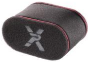
Dual filter socks