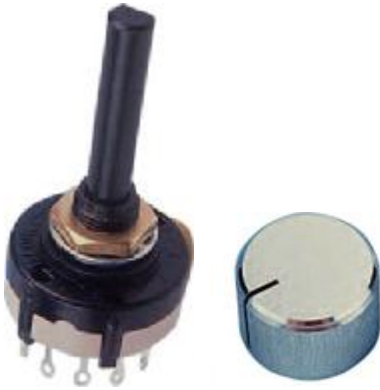
Dash switch & knob

Prewired - £10 or switch & resistor only - £3