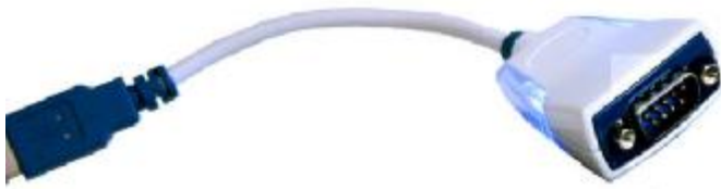
USB to serial port adapter

USB to serial port adaptor with FTDI chip (essential with the K3 ECU to avoid data corruption) - £14.99