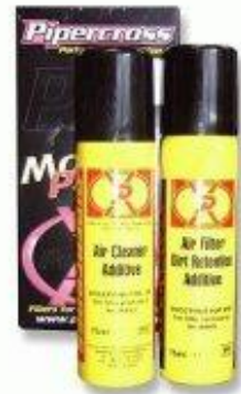
Filter Cleaner & conditioner

Pipercross PX600 domed or boxed foam filter - £51.74